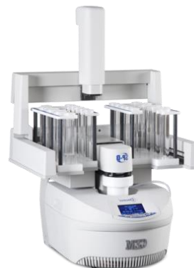
Discover SP-D 80ml