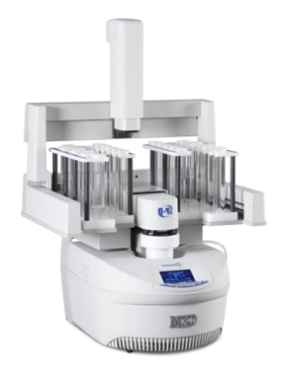
Discover SP-D 80ml