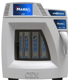
Figure 1. CEM MARS 6 with iPrep Vessels

Five chromium oxide catalyst samples were sampled from different lots for comparison. The chromium oxide was crushed into fine particles using a mortar and pestle in the hood. Each sample was accurately weighed and transferred to an iPrep vessel. \text{HNO}_3 and \text{H}_2\text{SO}_4 (dropwise) were added to the vessel. The sample was allowed to predigest before sealing. A Classic Method was created on the MARS 6, see Figure 1, with ramp and hold times and temperature programmed per Table 1. The samples were allowed to cool before being quantitatively transferred to a tared 100 mL centrifuge tube and the final weight recorded.