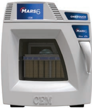
Figure 2. MARS 6 with iWave temperature sensor.