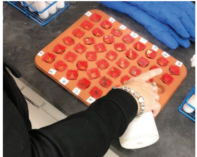
Figure 1. Sample Preparation of Bread Spreads

Bread spreads were frozen using liquid nitrogen by applying a known amount of sample to a silicone non-stick mold and pouring liquid nitrogen over the sample multiple times in order to flash freeze the sample, see Figure 1 . This was done to ensure that all of the sample reached the bottom of the digestion vessel, a task which is difficult when bread spreads are at room temperature.