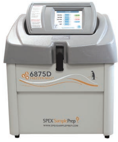
Figure 2. SPEX SamplePrep Freezer/Mill®