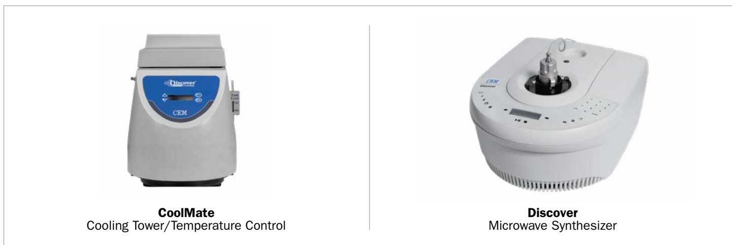
Figure 2. CEM CoolMate and Discover