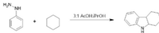
Table 3: Fisher-Indole Reagents Required

In the batch reaction, reagents were loaded into a 10 mL microwave vial equipped with a stir bar. The solution was heated to 210 °C for 3 minutes using 200 W of power. After cooling, the reaction was poured into 3 mL of cold water and the product isolated by suction filtration.