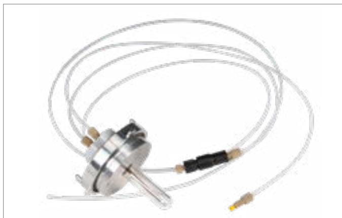
Figure 1: 10 mL Flow Cell for Discover 2.0 Microwave Synthesizer

Microwave chemistry has long been known to accelerate chemical transformations and provide a simple means to access more rigorous reaction conditions. Flow chemistry has demonstrated similar benefits, with the added bonus of being able to increase the reaction scale simply by prolonging the reaction. The combination of the two technologies opens the door to a quick optimization and easy scale-up of virtually unlimited types of chemical transformations. The Discover® 2.0 microwave synthesizer provides the means to perform both types of reactions simultaneously or sequentially within the same system.